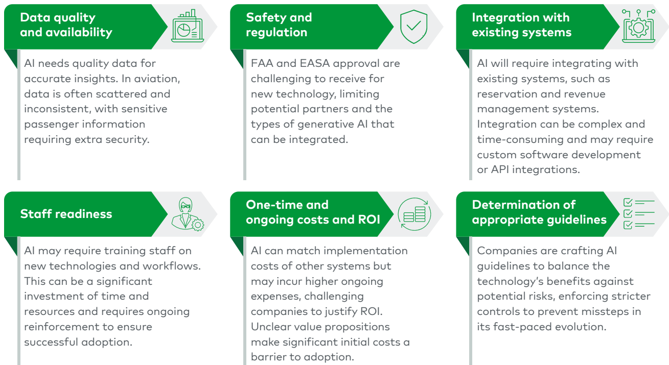
Figure 1 Key challenges of generative AI in the airline industry

While the benefits of generative AI are clear, deploying it in the airline industry can be challenging. See Figure 1 for some of the key barriers. 5